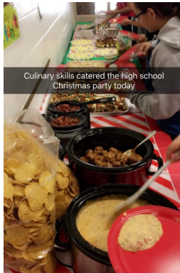
Culinary skills catered the high school Christmas party today