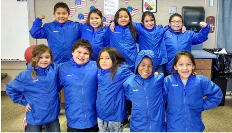
2 nd graders proudly wearing their blue winter coats they received for Christmas.